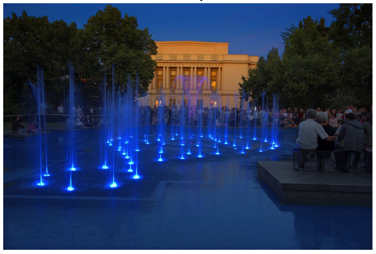
I. J. Paderewski Pomeranian Philharmonic in Bydgoszcz